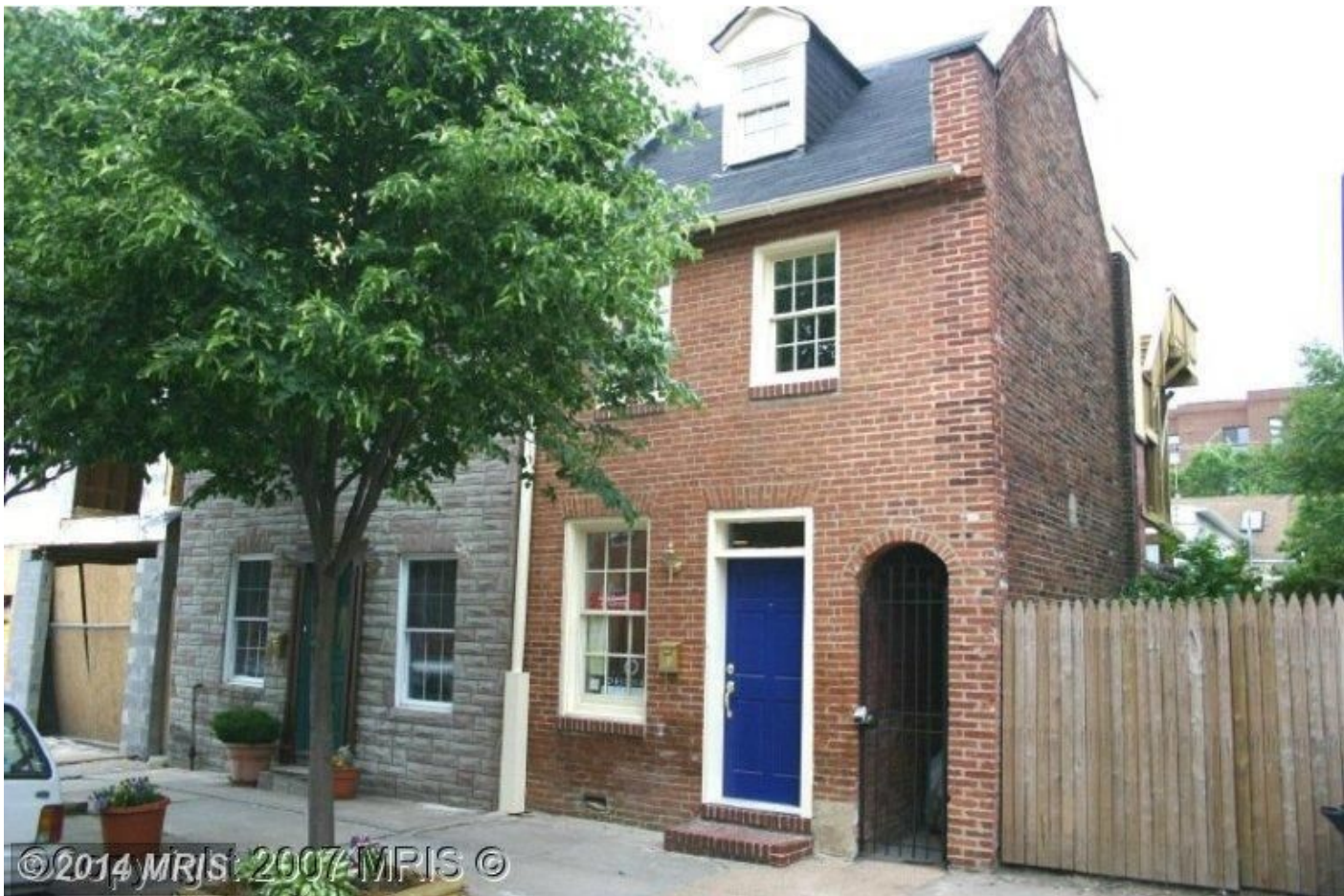
A townhouse in historic Fells Point.